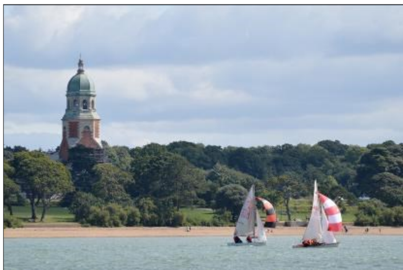
Royal Victoria Chapel, Netley Royal Victoria County Park