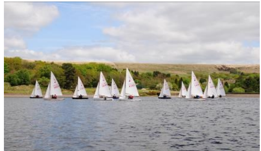
Delph Sailing Club

You can vote for your choice of Club of the Year until 27th January 2020 at: https://awards.yachtsandyachting.co.uk/rya/