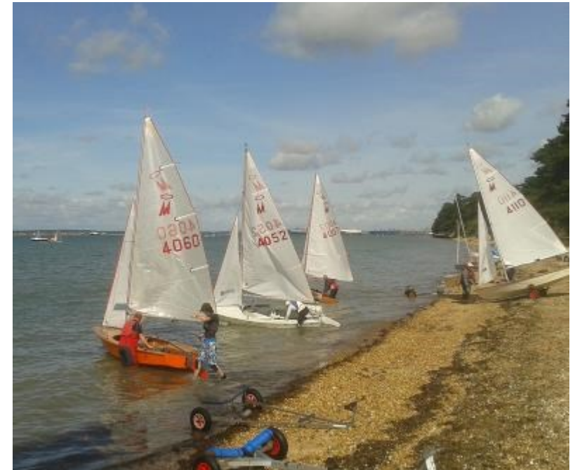
Launching at Netley in 2017

Miracle Association Magazine January 2020